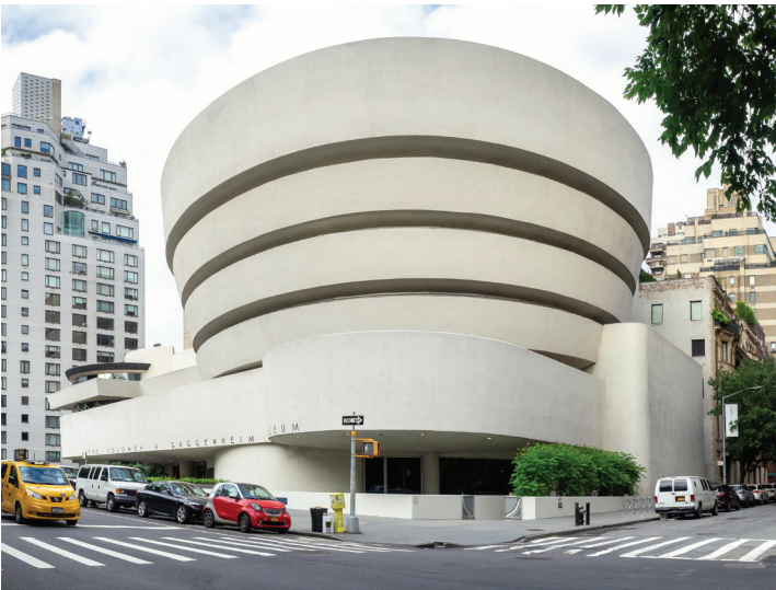
AJAY SURESH, ALANKITASSIGNMENTS