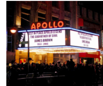
2 APOLLO THEATER