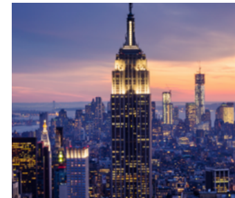
4 EMPIRE STATE BUILDING