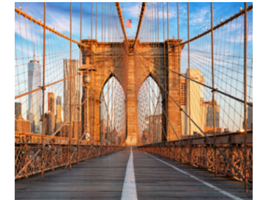
3 BROOKLYN BRIDGE