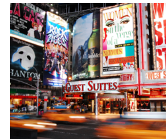
11 THEATER DISTRICT