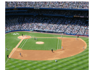
12 YANKEE STADIUM