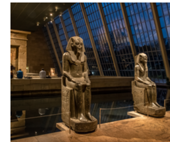
8 METROPOLITAN MUSEUM OF ART