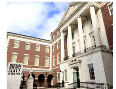
9 THE MUSEUM OF THE CITY OF NEW YORK