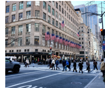
1 5TH AVENUE SHOPPING — SAKS FIFTH AVENUE