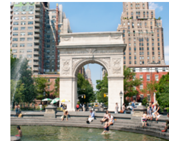
5 GREENWICH VILLAGE — WASHINGTON SQUARE PARK