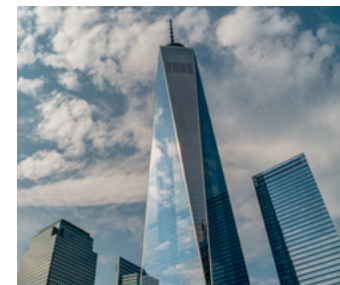
10 ONE WORLD TRADE CENTER