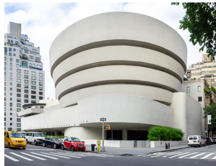
AJAY SURESH, ALANKIT ASSIGNMENTS