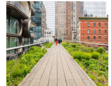
6 THE HIGH LINE